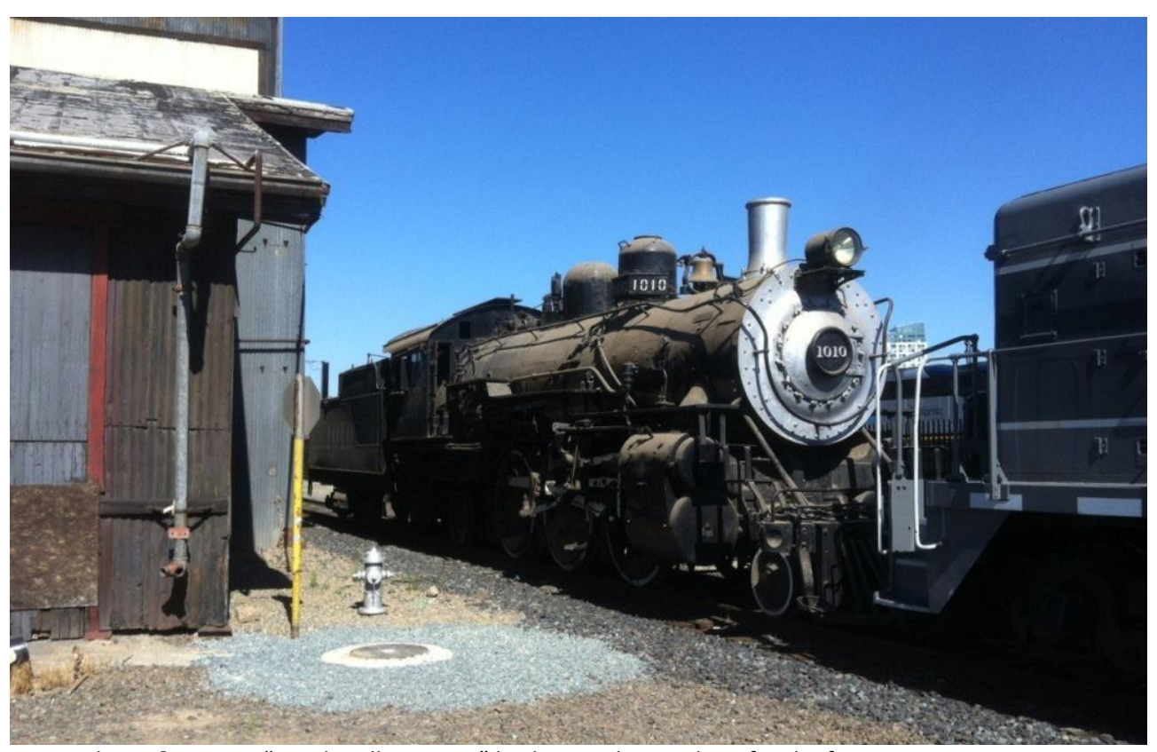
The AT&SF 1010 "Death Valley Scotty" basking in the sunshine for the first time in many years spotted on the Transfer Table Lead at the south end of the Boiler Shop.